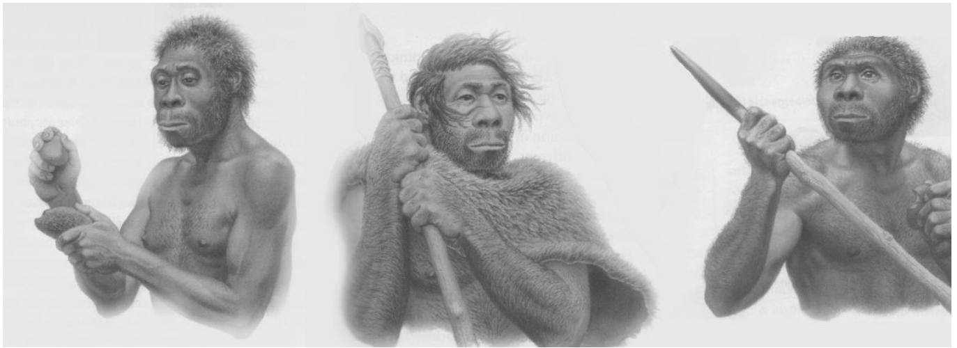
Figure 1. Artistic renditions of Homo ergaster , H. neanderthalensis and H. erectus (from Ian Tattersall, "Once We Were Not Alone," Scientific American 13, no. 2 (2003): pp 23-25.)

Our species is not the only human species which has ever existed. We are very similar even to non human primates. There is a continuity even though there is an undeniable difference. Evolutionists are unanimous that there are real differences between the lone surviving human species and other animals, but it is a matter of degree, rather than a fundamental, unbridgeable gulf. Forms of intellect, morality, culture, self awareness are found in other species, and almost certainly existed in the now extinct Homo and Australopithecine lines. It is, indeed, quite handy for many Christians that the Australopithecines and H. erectus are extinct, as they would remind us forcefully of our fundamental continuity with the rest of life.